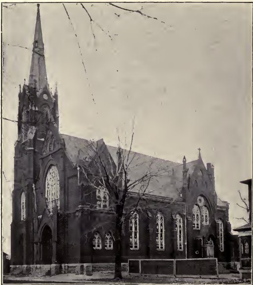
ST. MARY'S CATHOLIC CHURCH. Centralia, Illinois.